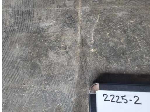
2225-2 Cementitious/Gray Mastic/Black (2% Chrysotile) Typical Interior Floor (Appx. 1,560 sf)