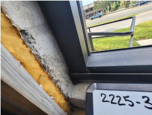
2225-3 Caulk Typical Windows