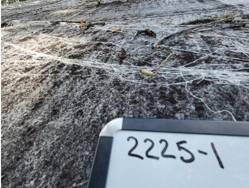
2225-1 Rolled Roofing Typical Exterior Roof